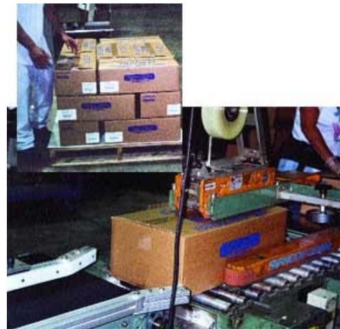
Completed cases, left, their labels readable on two sides, are manually loaded onto wooden pallets for transfer to a freezer. Shippers are taped in the length direction, below, by an automatic top-and-bottom case taper.

Butte adds, "Bringing in the printer/applicator is one of the very best changes we've made in our packaging operation. The machine is one of the most reliable I've ever been involved with, and that's critical with a packaging line that can handle nearly a hundred variations in product and container possibilities.