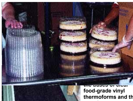
the bases of clear food-grade vinyl thermoforms and then cased.

Butte's solution is a wraparound labeler that prints and automatically applies a pressure-sensitive label to two sides of each shipper. It's Loveshaw's Little David Corner Wrap Labeler, acquired through Shrink Packaging Systems Corporation. With the first installed just more than a year ago and the second less than two months later, a new era of efficiency has been well-launched in the plant.